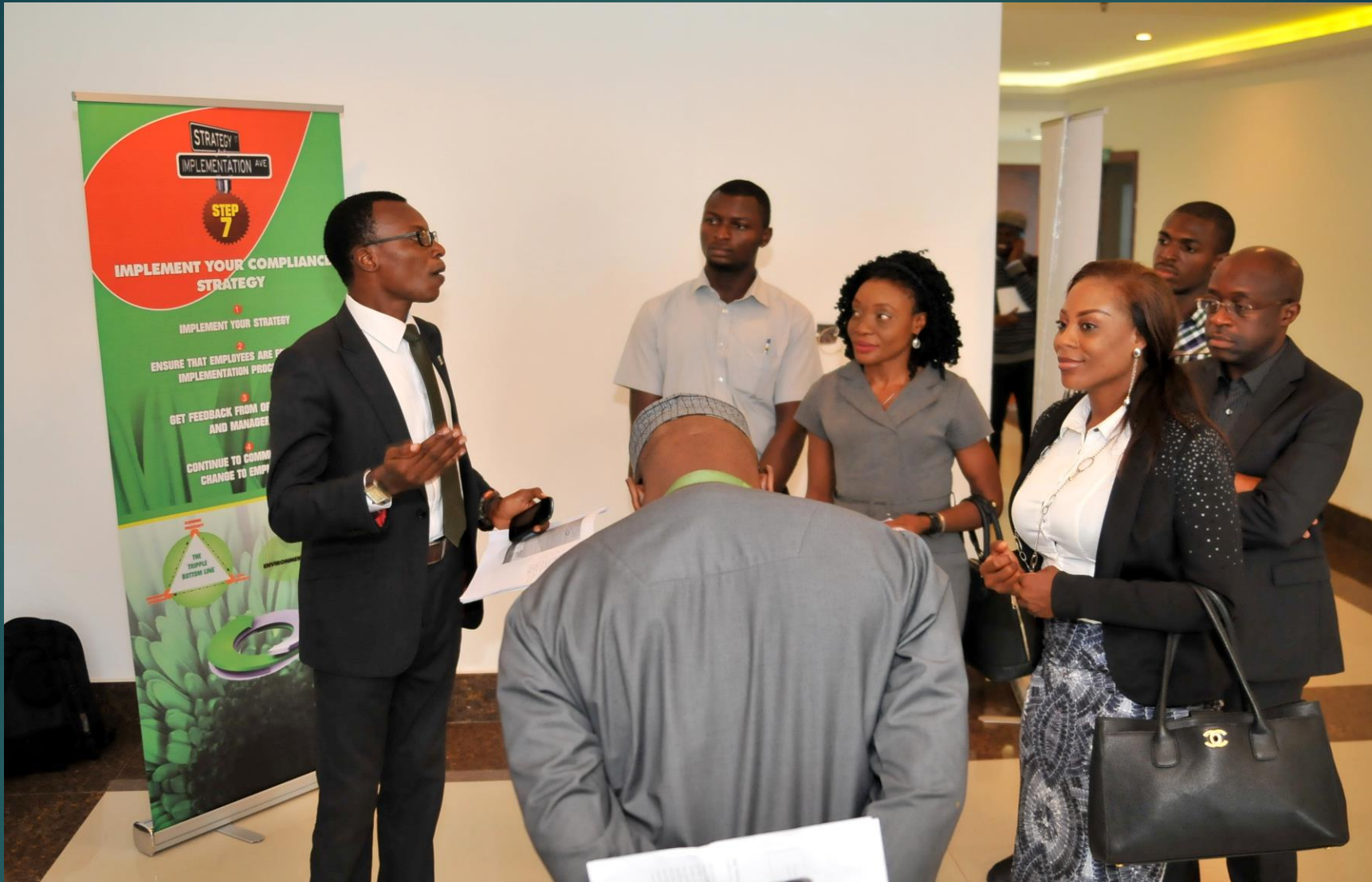
STEPHEN LAWSON (NTA CLIMATE CHANGE ANCHOR) CONDUCTING PARTICIPANTS THROUGH THE EIGHT STEPS TO ENVIRONMENTAL SUSTAINABILITY