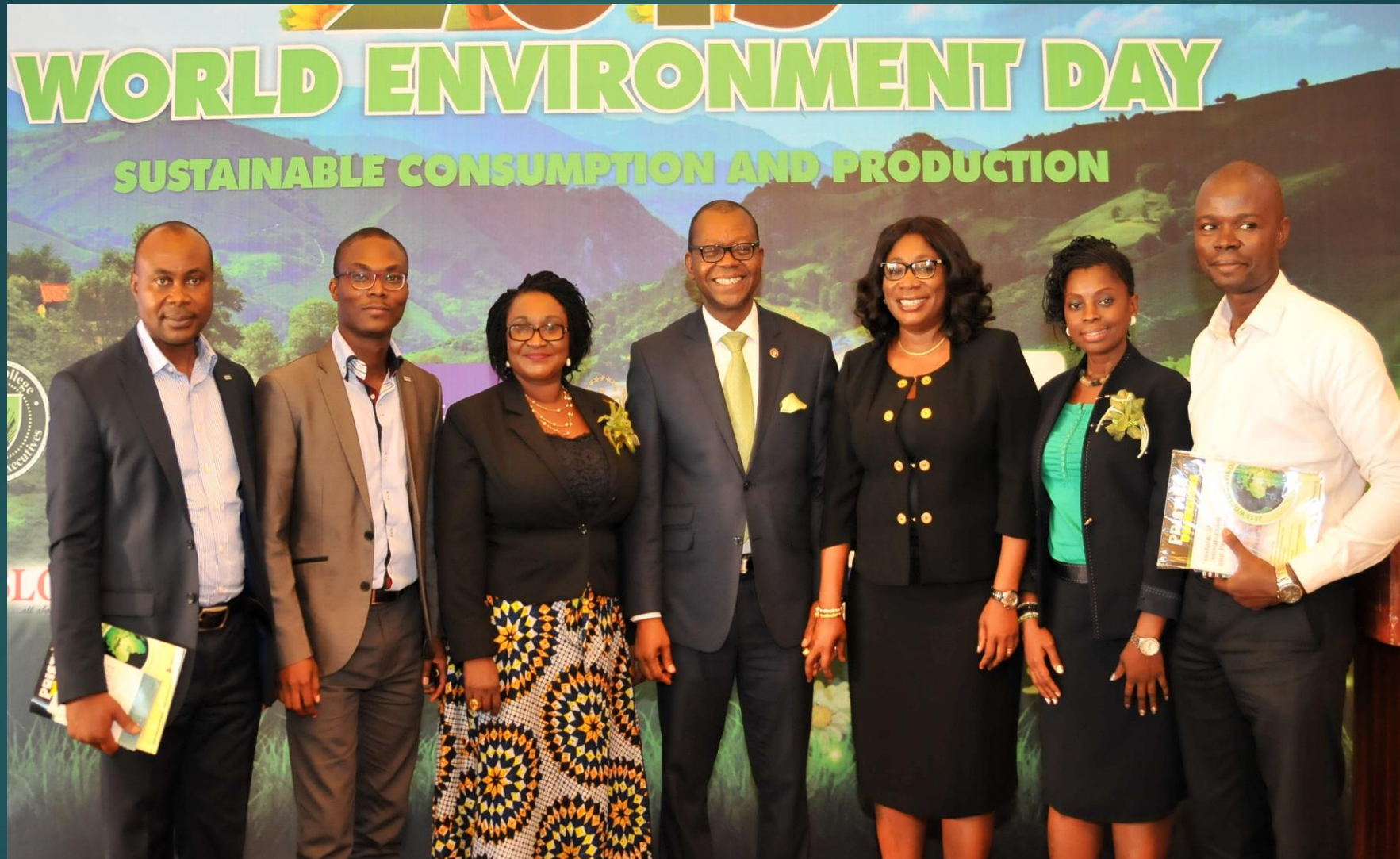
ECOLOGISTICS AND FCMB TEAM